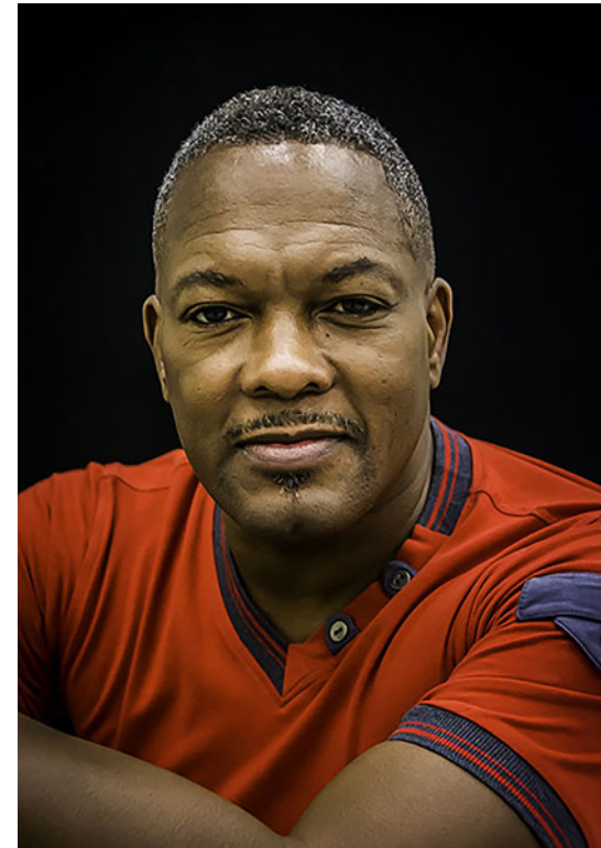
Co-Founder & Associate Artistic Director