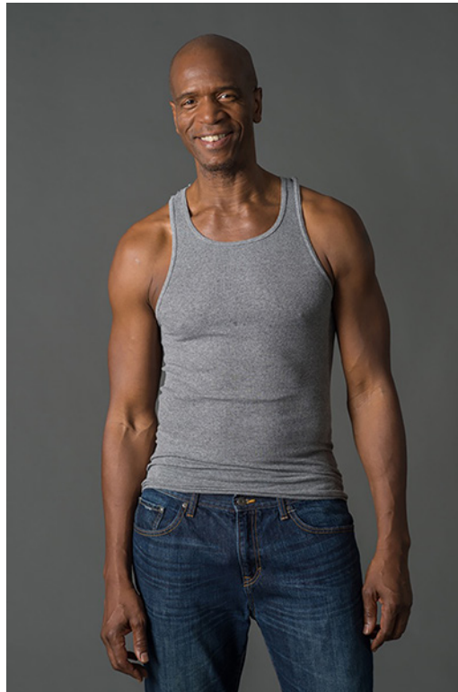
Co-Founder & Artistic Director